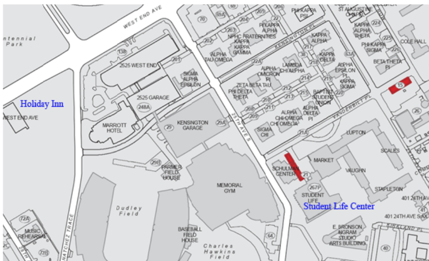
Vanderbilt University Map: Parking areas indicated in red.

Directions: http://www.vanderbilt.edu/studentlifecenter/directions.html